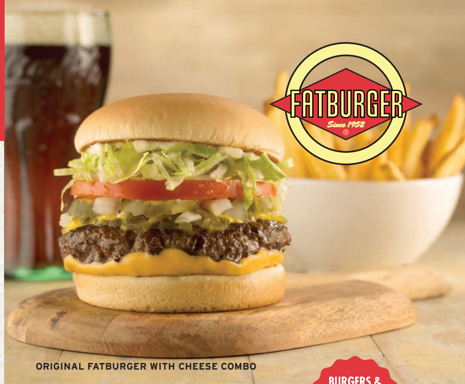
ORIGINAL FATBURGER WITH CHEESE COMBO

BURGERS & SANDWICHES CAN BE ORDERED A LA CARTE.