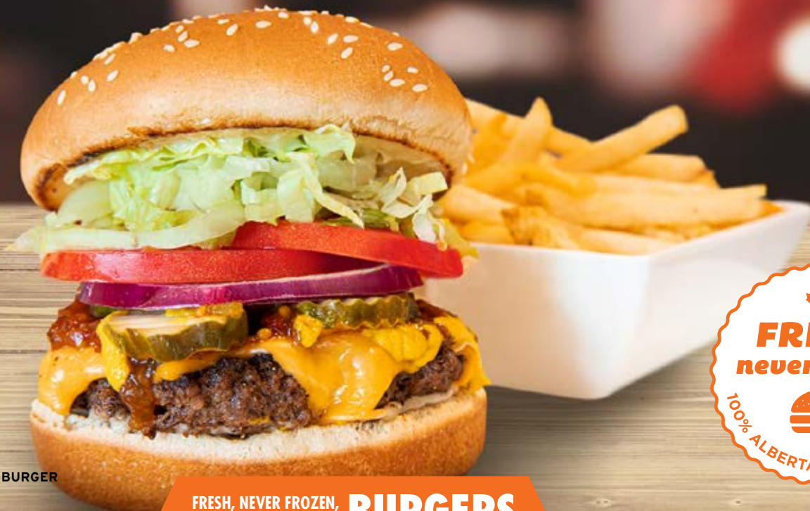
RICKY'S FAMOUS ORIGINAL BURGER