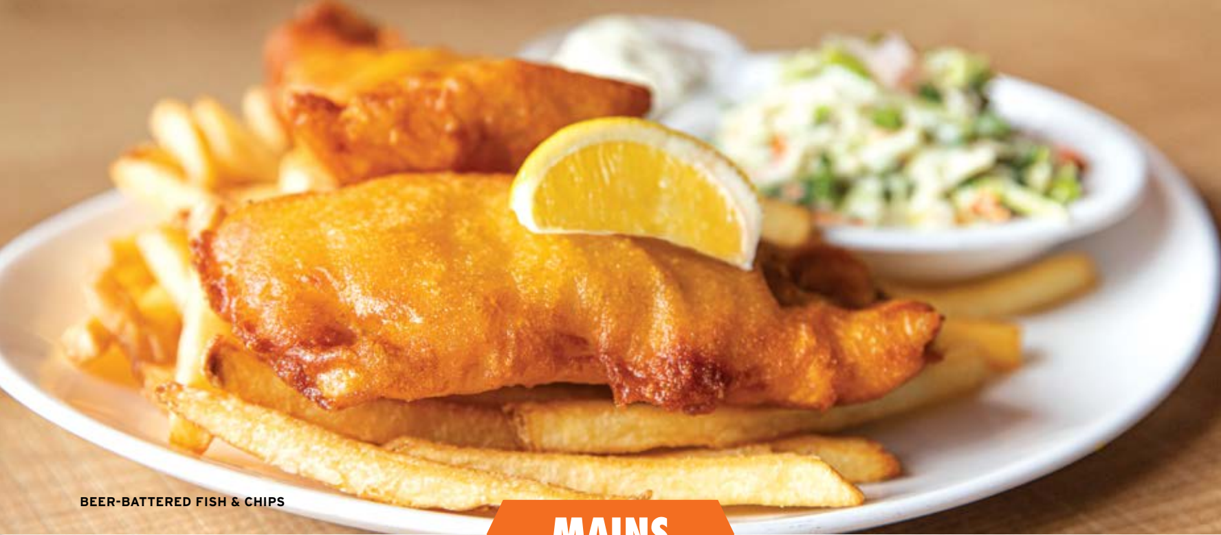
BEER-BATTERED FISH & CHIPS