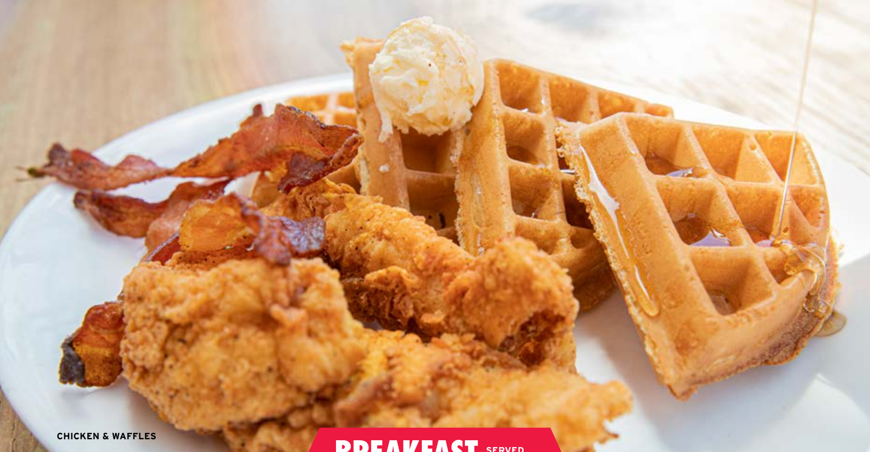
CHICKEN & WAFFLES